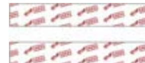
K-Tape 10,000₩ (6€)

Please note that the design and retail price are subject to change.