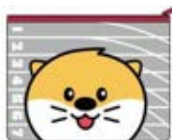
Pouch 5,000₩ (3€)