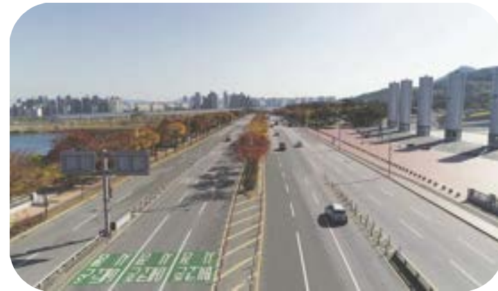
<Stadium and Warm-up Facility's Road View>

The shared flat course for the 10 km road run and the 10 km & 20 km race walk starts from the Athletes Promotion Center (Warm-up Facility) follows a route around Daegu Stadium (Main Stadium), passing by Daegu Samsung Lions Park, Daegu Art Museum, and Daegu Kansong Art Museum. The road events take place on a nature-friendly route surrounded by mountains and a lake, with the breeze and clean, fresh air.