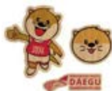
Wood Magnet 8,000₩ (5€)