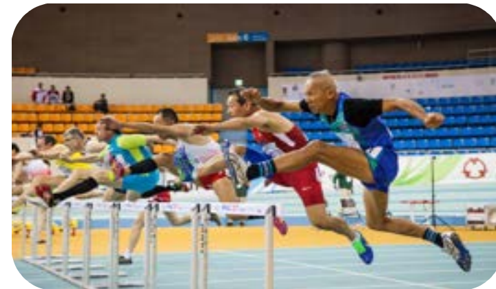
<WMACi Daegu 2017>

※ Non-competition day : 26 and 31 August