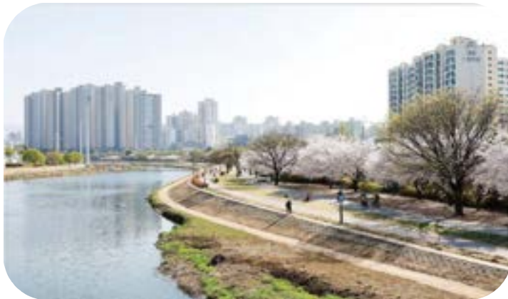
<Sincheondong-ro and the Otter>

The half marathon course, Sincheondong-ro, is located along the Sincheon Stream, which flows through the heart of Daegu from south to north. In addition, a swimming pool and a skating rink are available in Sincheon depending on the season, together with various workout and convenience facilities. Trees and wildflowers grow throughout the Sincheon, and the stream is home to the otter, a designated natural monument and mascot of the Championships, living in its first-grade water. Many locals visit for workouts and leisure, and the course is considered an ideal route to enjoy running in the fresh air and breeze.