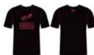
T-Shirt 35,000₩ (21€)