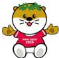
Mascot Doll 30,000₩ (18€)

Discover more products online and in stores!