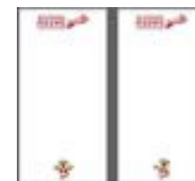
Towel Set (2p) 30,000₩ (18€)