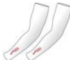
Arm Sleeves 7,000₩ (4€)