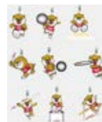
Acrylic Keyring 7,000₩ (4€)