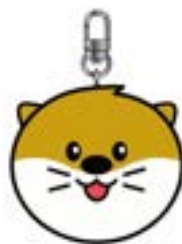
Keyring Doll 12,000₩ (7€)