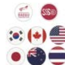
Pin Badge 2,000₩ (1€)