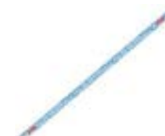
Sports Scarf 12,000₩ (7€)