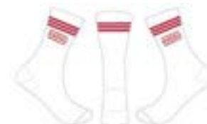
Socks(1p) 6,000₩ (4€)