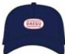
Ball Cap 32,000₩ (19€)