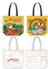
Reusable Bag 10,000₩ (6€)