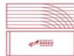
Sports Towel 10,000₩ (6€)