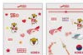
Decal Tattoos 8,000₩ (5€)