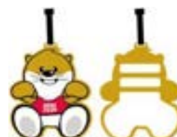
Luggage Tag 13,000₩ (8€)