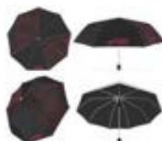
Umbrella 20,000₩ (12€)