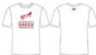
T-Shirt 35,000₩ (21€)