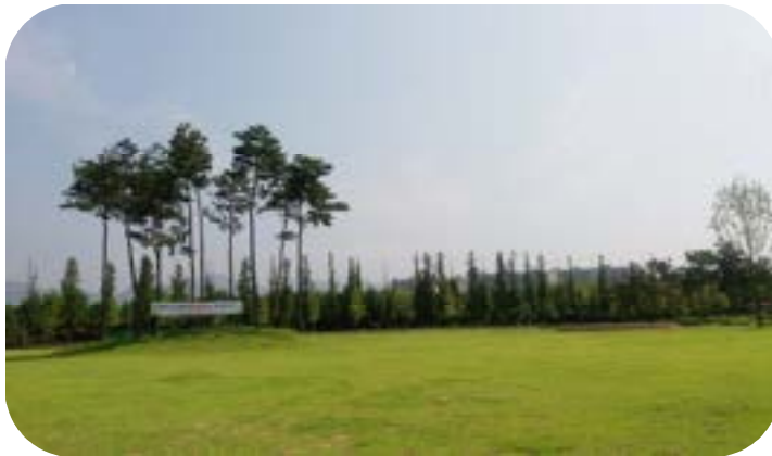
<Suseong Family Park View>

The 6 km and 8 km cross-country courses are looped routes within Suseong Family Park, each based on a 2 km course covered in 3 or 4 laps. Nature-friendly Suseong Family Park is designed for family activities and is well equipped with various workout and leisure facilities, including wide lawns, park golf field, inline skating track, and children's water playground. The grass public trail is an ideal place to experience nature while running. It is a 12-minute drive from Daegu Stadium (Main Stadium) to Suseong Family Park.