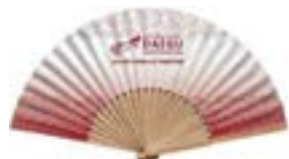
Folding Fan 10,000₩ (6€)